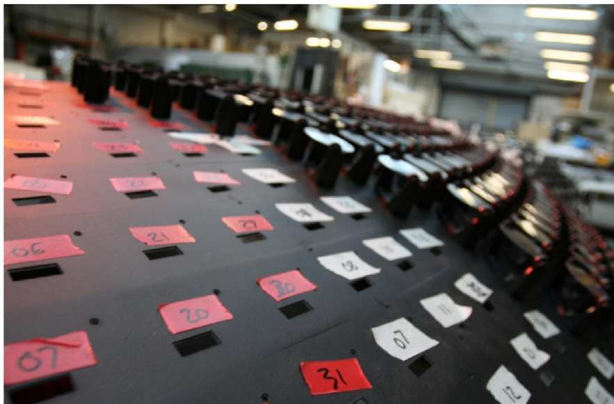
Figure 4. Making of "The Cloud"

But there are also engineers that rediscovered themselves as artists. Moritz Waldemeyer is among them. Waldemeyer started as a tech consultant for the conceptual fashion designer Hussein Chalayan, before launching his own creative practice. These studios usually begin their projects with an artistic approach, to then start a conversation with technicians and scientists to explore what technology allows them to make. This is when projects may take different routes by pulling and pushing between technological possibilities and artistic explorations. In this process, technical companies, whose expertise lays in engineering and fabricating artworks, are often involved.