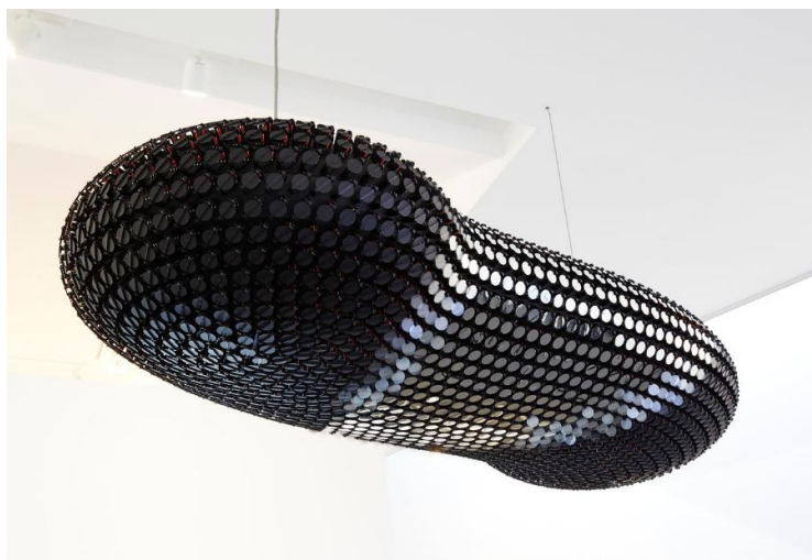
Figure 2. Kinetic sculpture "The Cloud" by Troika at Terminal 5 o Heathrow Airport, London

Many hybrid practices have arisen at the intersection between art and engineering. Many of them have a more artistic lead. This is the case of British studios such as Troika (Figures 1, 2 and 3) and Greyworld, the Paris-based creative collective HeHe and the Japanese offices TeamLab and Rhizomatiks, for example. There are also the longer-established art studios of Olafur Eliasson (Germany) or James Turrell (USA).