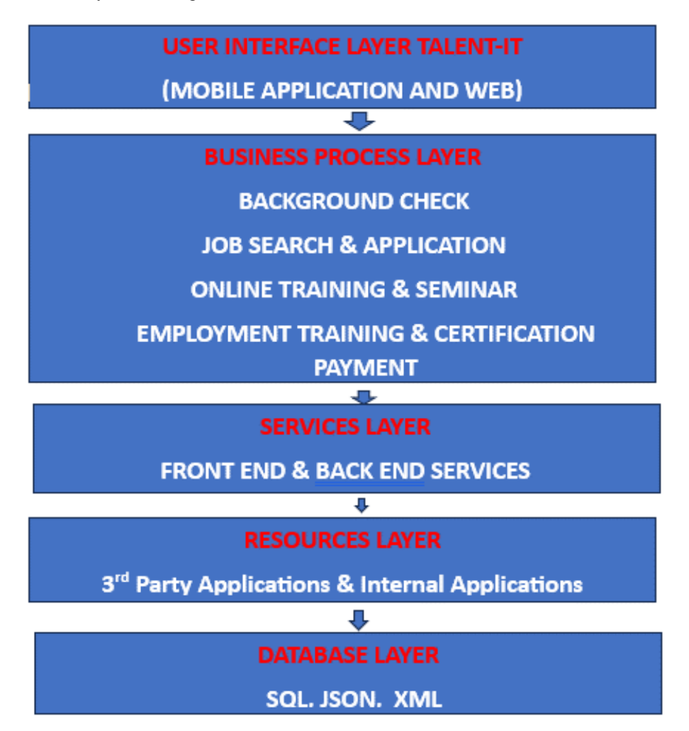
Figure 2. SOA Layer for TALENT-IT Ecosystems

As stated in Figure 1, TALENT-IT integrates various applications that provide services as business processes (Job Search & Application, Background Check, Employment and Training Certification, Online Training and Seminar, and Payment) using ESB. This allows TALENT-IT to transform the data models from the resources of the service providers (Professional Network/CV, Recruitment Application, Job Market, HR Information Systems, Identity Database Systems, Workforce Database Systems, MOOC/Online Training Providers, and Payment Gateways) and communicate (send requests/receive responses) with the Client (Web/Mobile) through the standard network protocol, which is SOAP/HTTP. This allows TALENT-IT to handle multiple requests by users effectively and efficiently. Then, we proposed the SOA layer for TALENT-IT ecosystems in Figure 2: